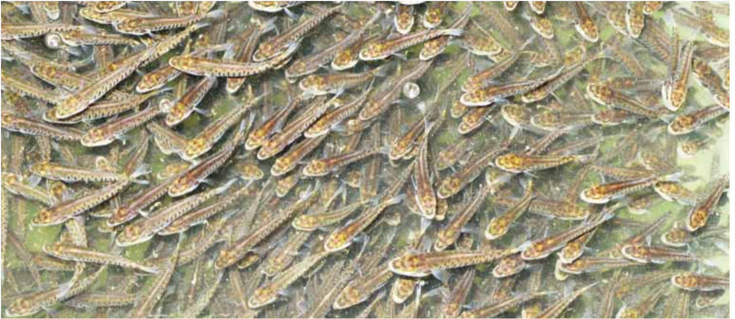
The Carbon Hill Fish Hatchery has produced over 80,000 smallmouth bass fingerlings to meet management stocking goals.